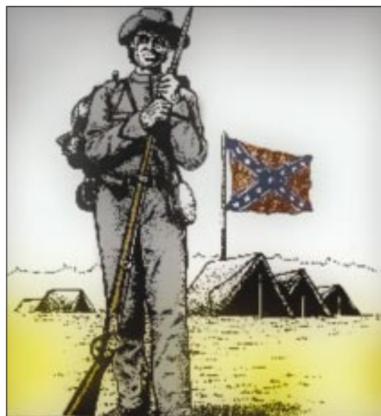
Fig 1 Confederate soldier, Vardy Collins, a Melungeon listed on an 1830 census as a “free person of colour”

What should we make of these developments? Well before the advent of molecular genetics, the calculation